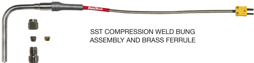
SST COMPRESSION WELD BUNG ASSEMBLY AND BRASS FERRULE